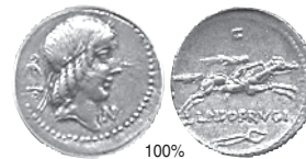
67 BC silver denarius of the Roman Republic struck by the moneyer Calpurnius Piso Obv: wreathed head of Apollo wearing long curled locks Rev: racehorse at full gallop ICG AU 50 PQ..... $247.