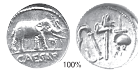
49-48 BC silver denarius of Julius Caesar Obv: Elephant trampling snake Rev: priest's sacrificial implements NGC Abt. Unc..... $1,877.