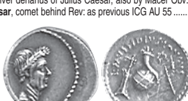
42 BC silver denarius struck by moneyer L. Mussidius Longus in Rome Obv: portrait of Julius Caesar Rev: globe with cornucopiae, rudder, caduceus, and priest's hat ICG AU 50..... $7,700.