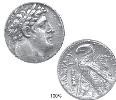
96-95 BC silver shekel of Tyre Obv: Melquarth Rev: eagle. The traditional "30 Pieces of Silver" paid to Judas from the treasury in Jerusalem. ICG EF 40 nice old toning..... $927.

Many slabbed ancients may be genuine only, grades in parentheses will be my opinion.