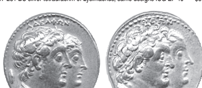
297-281 BC silver tetrachm of Lysimachus, same designs ICG EF 40 $877.