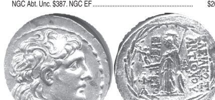
163-130 BC Silver drachm of Ariarathes V of Cappadocia 163-130 BC. This cultured Greek monarch allied himself with the advancing Romans. Obv: his diademed portrait in bold very high relief Hellenistic style Rev: Athena standing NGC Abt. Unc. $387. NGC EF..... $267.