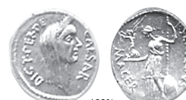
Early 44 BC silver denarius of Julius Caesar, struck by his supporter P. Sepullius Macer Obv: laureate and veiled bust of Julius Caesar. "Caesar Dictator for Life" Rev: standing Venus holding scepter and Victory. ICG AU 58.... $11,700.