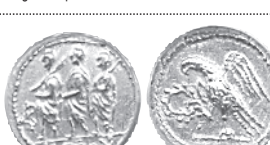
44-42 BC gold staters in the name of the Thracian Greek king Koson, with Roman Republican designs of Brutus. Obv: Brutus the consul, walking, flanked by lictors Rev: classic Roman eagle, holding wreath. ICG MS 63..... $1,077.