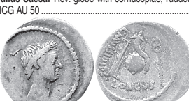
42 BC same designs as previous Obverse: face of Julius Caesar ICG F 12 PQ..... $1,977.