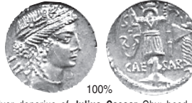
48-47 BC silver denarius of Julius Caesar Obv: head of Venus Rev: trophy of captured Gaulish arms and armour NGC Abt. Unc..... $1,977. ICG AU 58..... $2,775.