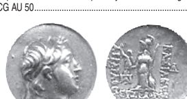
171-135 BC Silver tetrachm of Eukratides I, Greek usurper king of Baktria. Obv: Helmeted, heroic nude bust of Eukratides preparing to hurl spear, diadem from his helmet trailing down his back. This very unusual view of the warrior king emphasizes his athletic prowess by showing his back muscles. This difficult perspective was not attempted by ancient die engravers very often. Pleasing ICG AU 50..... $7,700.