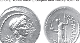
Early 44 BC silver denarius of Julius Caesar, also by Macer Obv: laureate bust of Julius Caesar, comet behind Rev: as previous ICG AU 55..... $8,700.