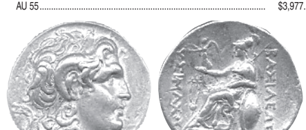
297-281 BC Gold stater of Lysimachus, Thracian successor of Alexander the Great Obv: portrait of the deified Alexander wearing the horn of the Egyptian god Ammon Rev: helmeted Athena enthroned, holding Nike ICG AU 55..... $3,977.